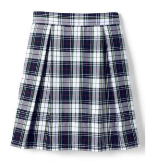
*Plaid Skort or Skirt

*Denotes Required options for Chapel Days (you may choose any of the button up shirts for chapel) If your child chooses to order a skirt, she must have appropriate shorts underneath. **All students are required to have a red polo shirt for field trips. **For PE, girls may wear appropriate length navy, red, white, gray, or black shorts along with a Strong Rock t-shirt.