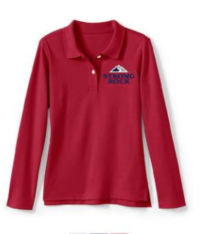
Long Sleeve Polo Shirt