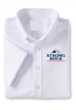
*Short Sleeve w/ Mtn. Logo