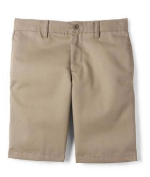
Plain Front Chino Shorts