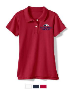
Short Sleeve Polo Shirt