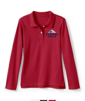
Long Sleeve Polo Shirt