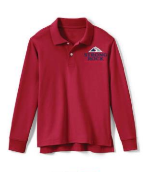
Long Sleeve Polo Shirt *White (Chapel Option)