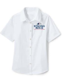
*Short Sleeve w/ Mtn. Logo