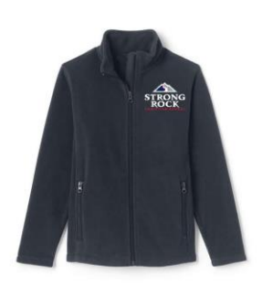
Uniform Fleece Jacket

*There are other outerwear options available in store at J & R Uniforms.