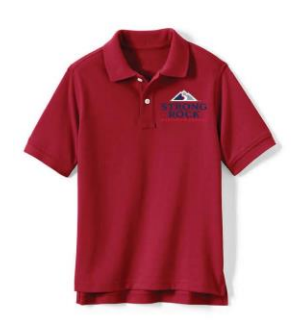
Short Sleeve Polo Shirt *White (Chapel Option)