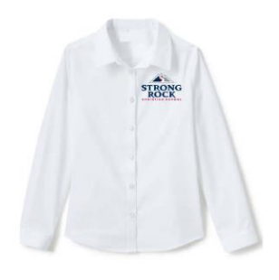
*Long Sleeve w/ Mtn. Logo