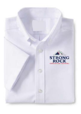
*Short Sleeve w/ Mtn. Logo