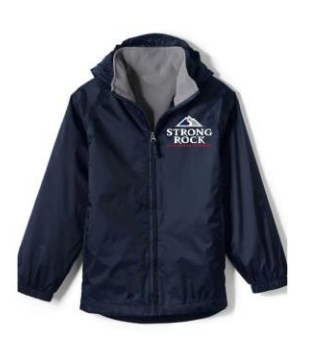
Uniform Fleece Lined Rain Jacket