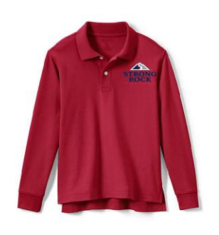
Long Sleeve Polo Shirt