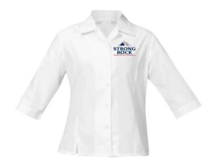
*3/4 Sleeve w/ Mtn. Logo