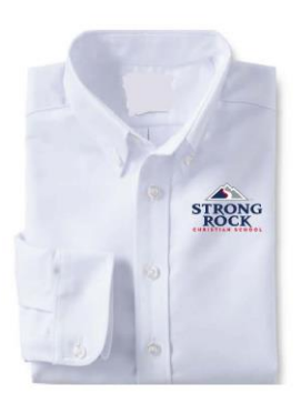
*Long Sleeve w/ Mtn. Logo