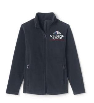
Uniform Fleece Jacket