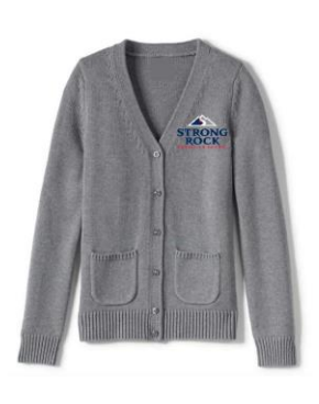
Button Front Sweater w/ pockets