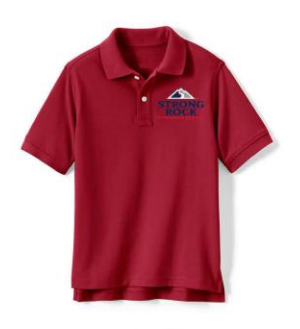
Short Sleeve Polo Shirt