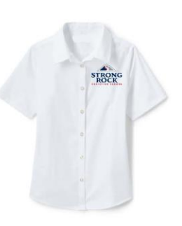
*Short Sleeve w/ Mtn. Logo