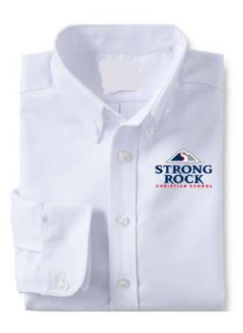
*Long Sleeve w/ Mtn. Logo