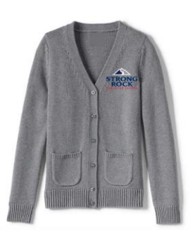
Button Front Sweater w/ pockets