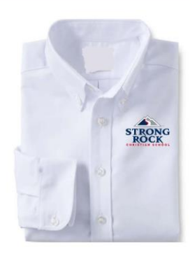
*Long Sleeve w/ Mtn. Logo