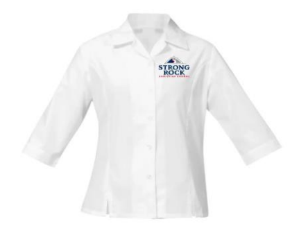
*3/4 Sleeve w/ Mtn. Logo