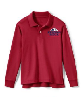
Long Sleeve Polo Shirt