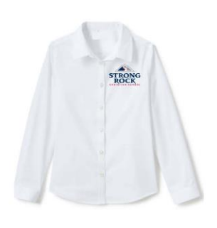
*Long Sleeve w/ Mtn. Logo